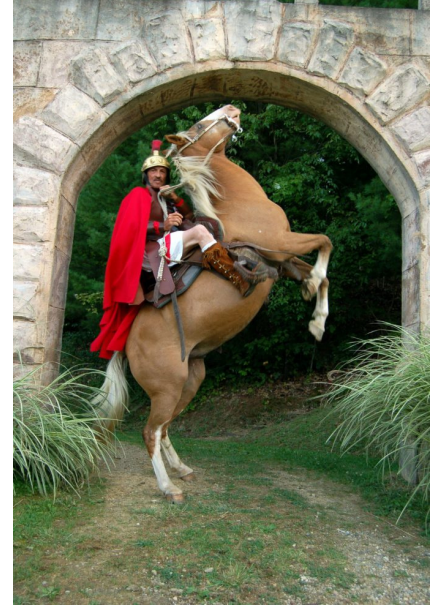
Living Word Outdoor Drama Celebrating 50 years

About Us. Long before it was hip to take a trip on Route 66, the National Road, An All American Scenic Byway, served as America's first highway to adventure. Positioned along America's early frontier, Cambridge/Guernsey County in Southeast Ohio has been welcoming travelers to the area for nearly 200 years. Your groups will enjoy a piece of idyllic Americana in which Main Street USA is the heart of our communities and life moves at a more relaxed pace.