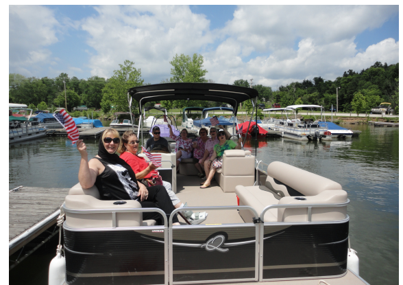
Seneca Lake Pontoon Boat Ride