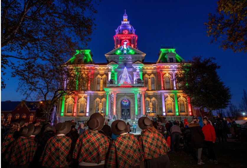
Guernsey County Courthouse Light Show