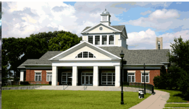
National Museum of the United States Air Force (left)